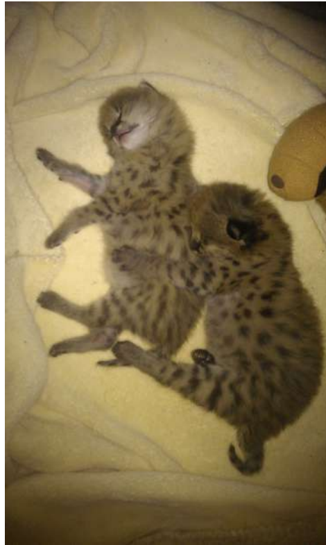
• Crunchie & Simba at just 10 days old