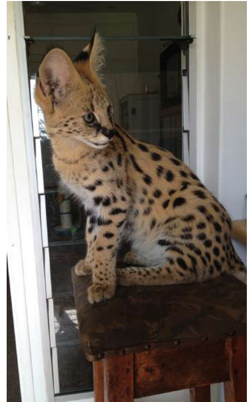
• Crunchie showing off