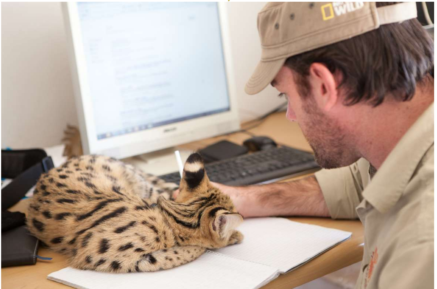
• Crunchie asleep on the job