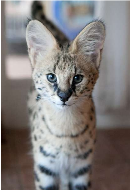
• Simba staring into your heart